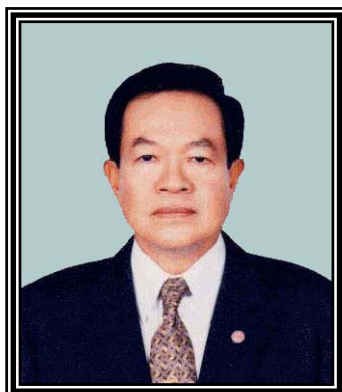
General Watanachai Chaimuanwong